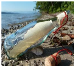
Messages in a bottle.

A word from us... Welcome back, we hope you have enjoyed your break and that the children are feeling refreshed and ready to start the new year. This half term our topic is 'Messages in a Bottle!' We will start by following the children's interest in the forest and changes we can see over the winter, animals and their habitats and how some are endangered because of climate changes. We will be taking part in the RSPB's Big School's Birdwatch and making bird feeders, as well as sharing the important message about trying to save our planet and endangered species. We will also be looking at important messages each week found in the different bottles around the classroom. These will relate to stranger danger, and e safety, having the right attitude, being honest to yourself and others and being sorry and giving forgiveness. There will be a message centre in the classroom where children will be encouraged to write messages to each other.